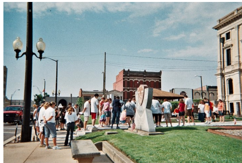
Grant County Courthouse Prayer Point

On Saturday, June 11 more individuals gathered than ever before (94) to participate in our annual LifeWalk. Folks of all ages, representing 18 churches! walked throughout down-town Marion, stopping to pray for their community at various prayer points along the way. In unity they prayed for Marion's neighborhoods, schools, churches, the Grant County Court Houses, Marion General Hospital, Open Door Family Planning, and